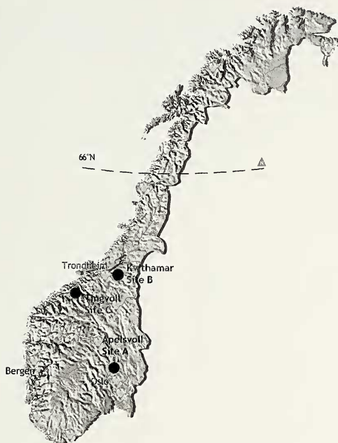
Figure 1.—Map of Norway showing the three sites (black dots) where samples were collected. The broken line shows the Arctic Circle.

2009). Also, the species diversity in both families is influenced by the heterogeneity of both the landscape and the adjacent habitat (Bishop & Riechert 1990; Öberg et al. 2008; Schmidt-Entling & Döbeli 2009).